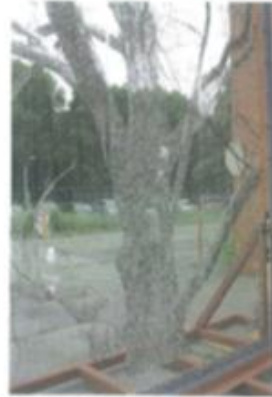
Photo 3: Overall view of tapestry prior to windblown debris testing.