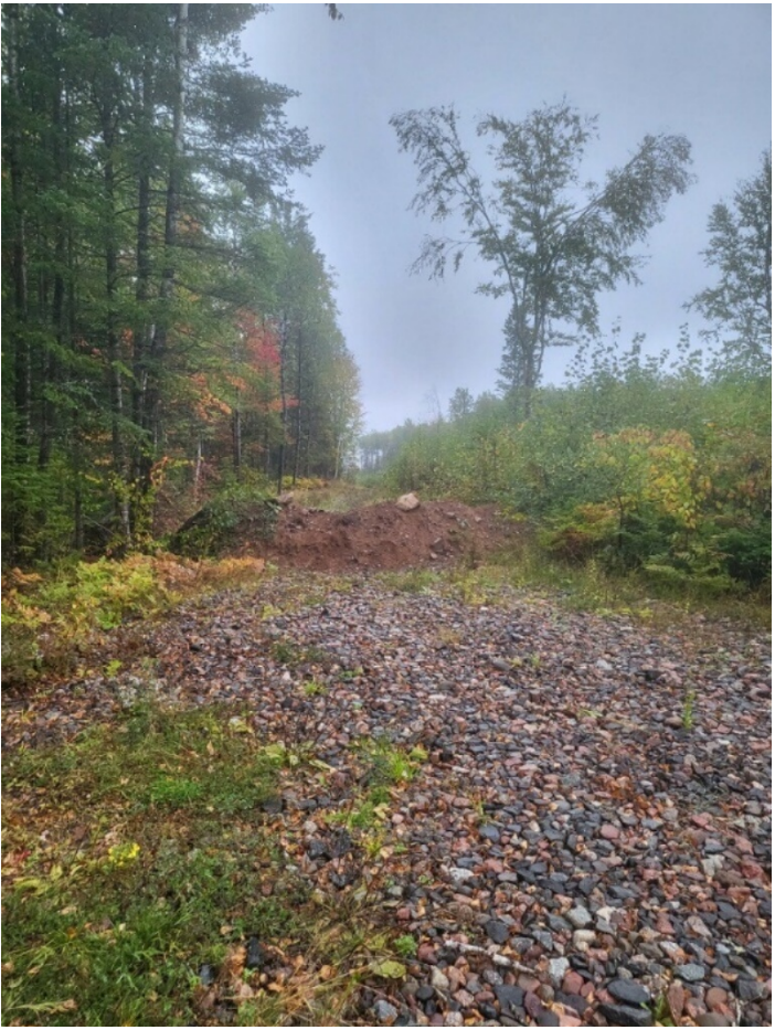
Closed road on USFS land in Wisconsin.

Failures to Manage and Maintain Accessible Roads