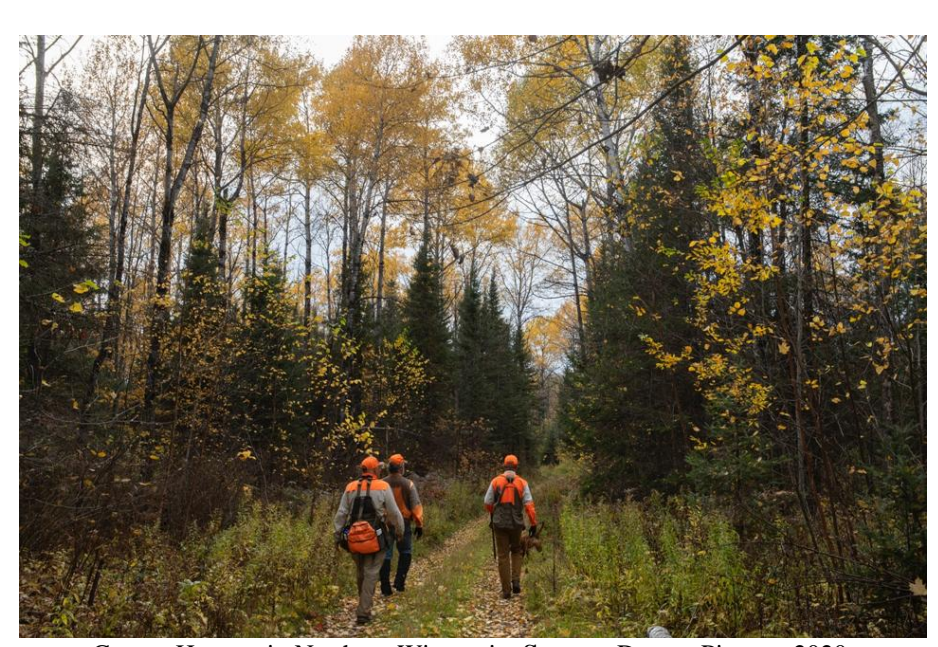
Grouse Hunters in Northern Wisconsin.

Hunting and fishing are more than just time-honored pastimes, they are engrained in the fabric of America's culture and heritage. Values instilled from hunting, fishing, and recreational shooting activities are passed down through generations and sustain