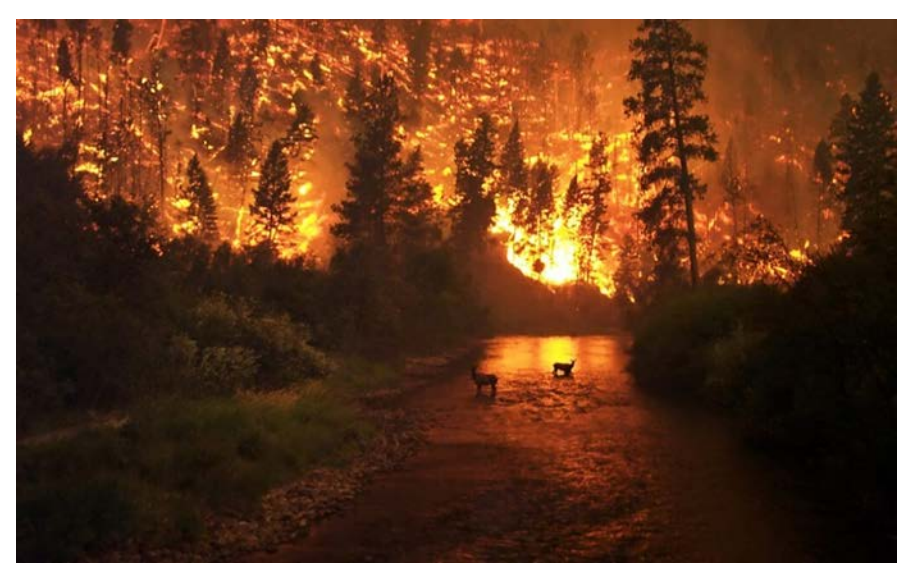
Wildlife during a fire in the Bitterroot National Forest.

"lush canyons and [a] mixture of rare and endangered species" into an "apocalypse" that looked like "ground zero after a nuclear explosion." Wildfires in Washington also killed nearly half of the state's endangered pygmy rabbit population. A Seattle Times report stated: "The rabbits had asphyxiated as the fire in its fury devoured oxygen from the atmosphere. 'There was nothing but